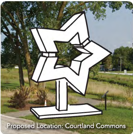
Proposed Location: Courtland Commons