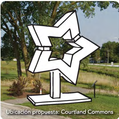
Ubicación propuesta: Courtland Commons

TEMA DE LA ESTRELLA: CEMPASÚCHIL, MONARCAS Y LA HERENCIA MEXICANA